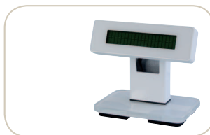
4. VFD stand alone customer display