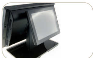
5. 8.4" rear mount customer display