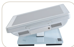
2. Stand in metal-glass-construction