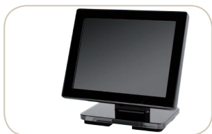
3. 8.4" stand alone customer display