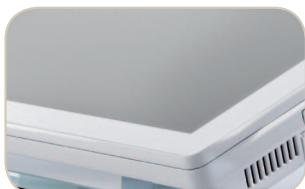
1. Bezel-free touch